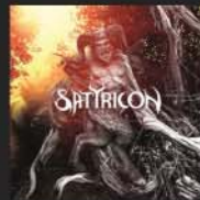
SATYRICON - SATYRICON