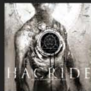
HACRIDE - BACK TO WHERE YOU'VE NEVER BEEN