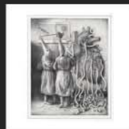
ALTAAR - S/T