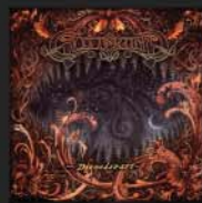
GLITTERTIND - DJEVENSVART

I 2014 GLEDER VI OSS OVER NYE ALBUM MED BL.A.