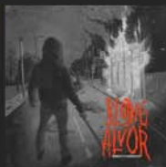
BLODIG ALVOR - S/T