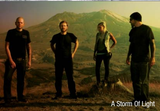
A Storm Of Light