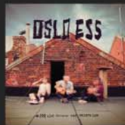
OSLO ESS - #199 LIVE AKUSTIK FRA ROCKEFELLER