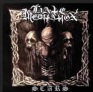
HATE MEDITATION - SCARS