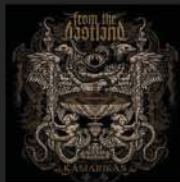
FROM THE VASTLAND - KAMARIKAN