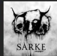
SARKE - ARIUAGHT