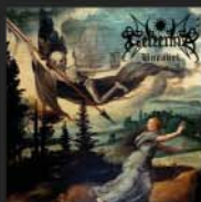
GEHENNA - UNRAVEL