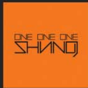
SHINING - ONE ONE ONE