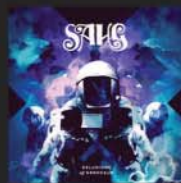
SAHG - DELUSIONS OF GRANDEUR