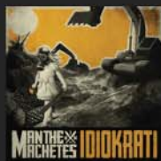
MAN THE MACHETE - IDIOKRATI