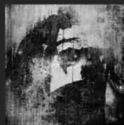
INTEGRITY - BLACK HEKSEN RISE 7"