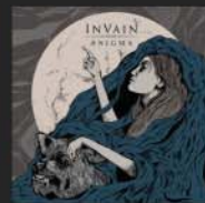
IN VAIN - ENIGMA