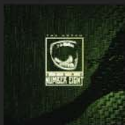
STEAK NUMBER EIGHT - THE HUTCH