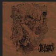
OBLITERATION - BLACK DEATH HORIZON