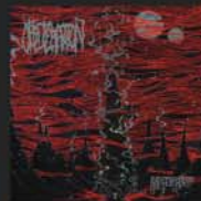
OBLITERATION - GOAT SKULL CROWN