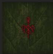
WARDRUNA - YGGDRASIL