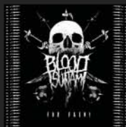
BLOOD TSUNAMI - FOR FAEN