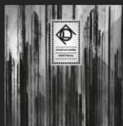
CULT OF LUNA - VERTIKAL

VI TAKKER VÅRE ARTISTER FOR ET FANTASTISK 2013.