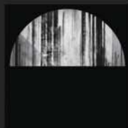
CULT OF LUNA - VERTIKAL II