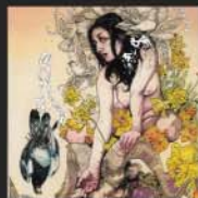
KVELERTAK - MEIR