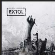
EXTOL - EXTOL