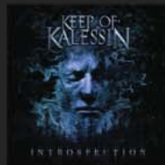
KEEP OF KALESSIN - INTROSPECTION