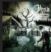
VREID - WELCOME FAREWELL